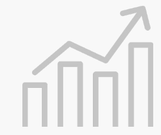
1x Test Talent Dynamic